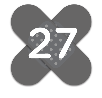
MICROSOFT HYPER-V PATCHES

Do you want to have to reboot your data center every Patch Tuesday?