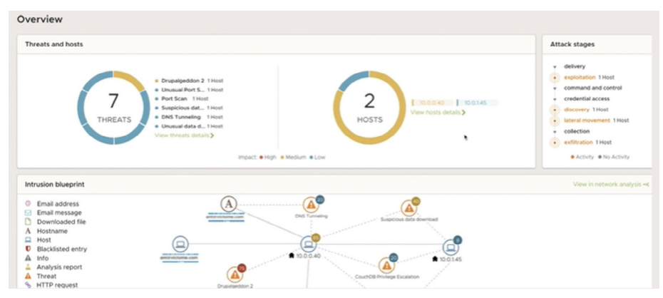
Figure 2: The attack chain as shown in NSX ATP (standalone)<sup>3</sup>

Armed with this information, security teams can quickly understand the scope of the attack, zero in on real threats, and focus their attention on mitigation and remediation before damage can be done.